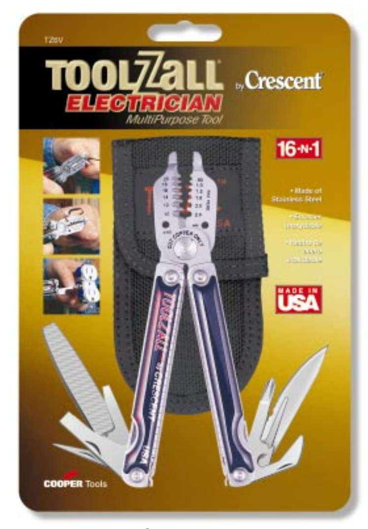
Phillips® is a registered trademark of The Phillips Screw Company.